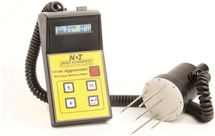
Aggrameter® Instrument and Sensor

For instantaneous determination of the moisture content of sand, fine aggregate and coarse aggregate using a unique microwave sensor